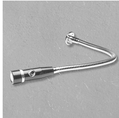
Figure 1 shows the V-450 connected to the Valcom V-9939 microphone adapter.